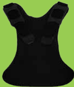
DLK for Stealth, Oasis, Primo & Edge