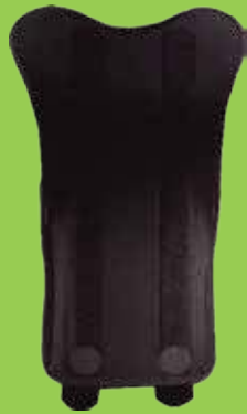
DLK for VertaMax