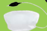
Pneumatic Bladder UNATTACHED • ATTACHED