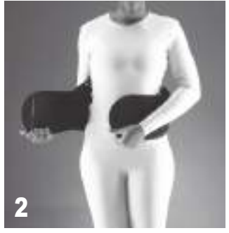
Align left front plastic panel on your abdomen and press firmly with your left hand. Pull right side of soft panel with velcro ^{I\!\!R} over the left velcro attachment.