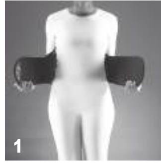
Place Stealth orthosis around your waist and center the back plastic panel on your back.