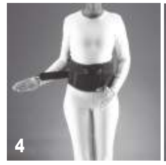
Secure the left compression strap to the center of the orthosis.

Using the arthritic thumb grips, detach the bottom compression straps for orthosis that have two straps on each side, or the single strap for orthosis that have only one strap on each side, and pull straps simultaneously away from your body.